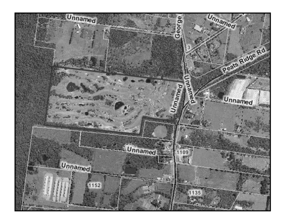
Diagram 3: Applicant's Site Plan